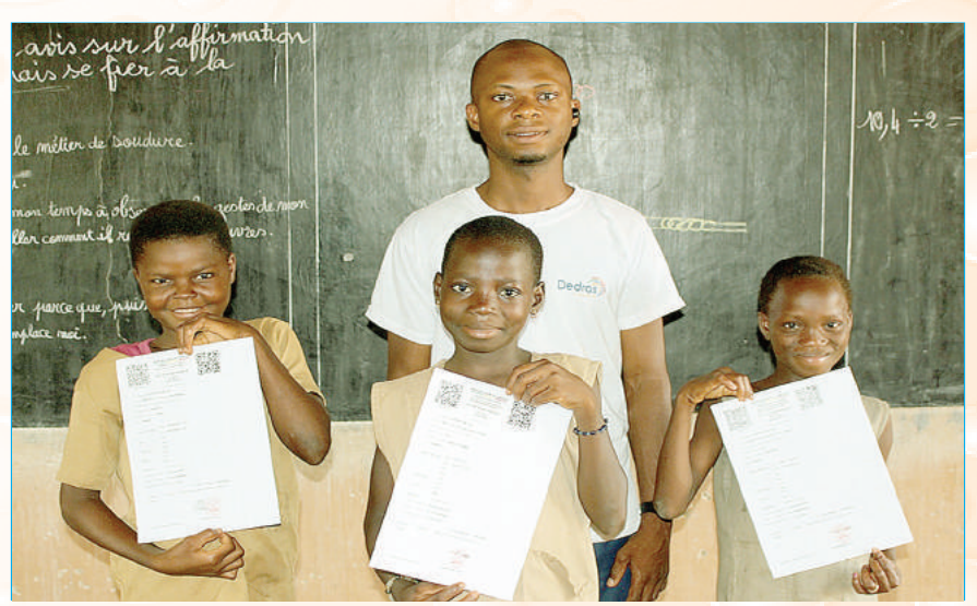
Some children of the primary school of Koudengou/Natitingou with their secure birth certificates received from DEDRAS

In a world where access to fundamental rights is crucial, every child deserves to build their future on solid foundations. In Benin, this opportunity is often compromised from birth by the absence of an essential document: the birth certificate. Fortunately, DEDRAS, in collaboration with its partners Woord en Daad and the AFAS Foundation, is gradually changing this situation. Thanks to their ambitious project "Breaking the chains of child labor and domestic exploitation in Benin and Burkina Faso," many children are seeing their future unlocked.