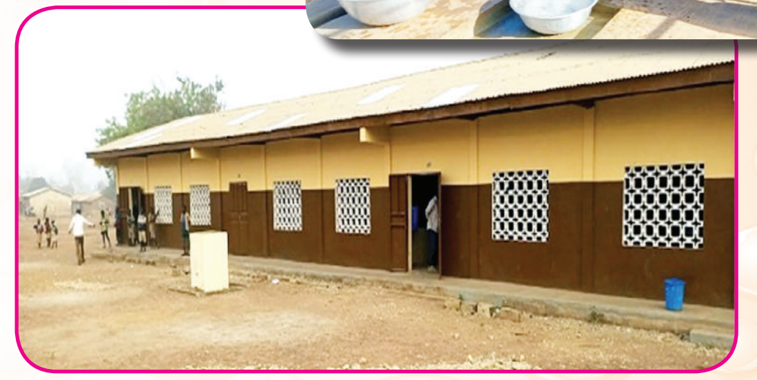
Reception of a drinking water source at the EPP Ganikperou/Kouandé

Renovation of a three-class module by the AGIR-Benin project at the EPP Sayakrou commune of Pehunco