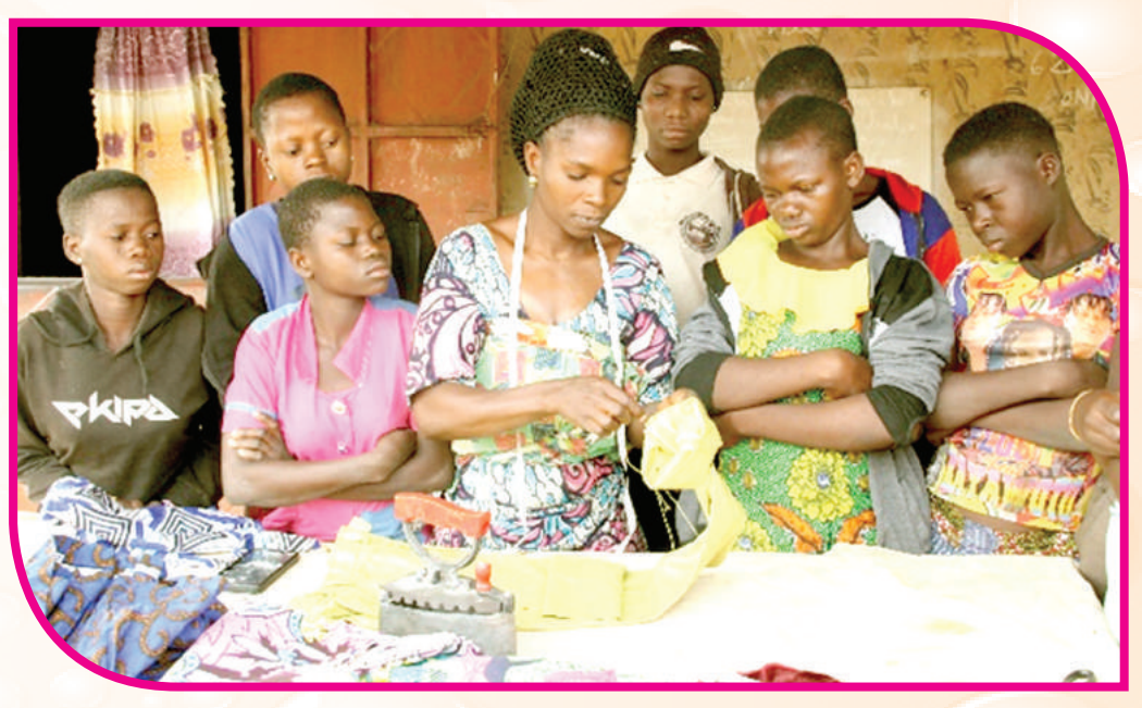
Girl victims of exploitation put in sewing apprenticeships in the Koussoukouingou commune of Boukoumbé

These actions will continue until 2027, to reach as many vulnerable children as possible, particularly girls. DEDRAS and its partners are committed to continuing to fight so that every child in Benin enjoys their fundamental rights, including the right