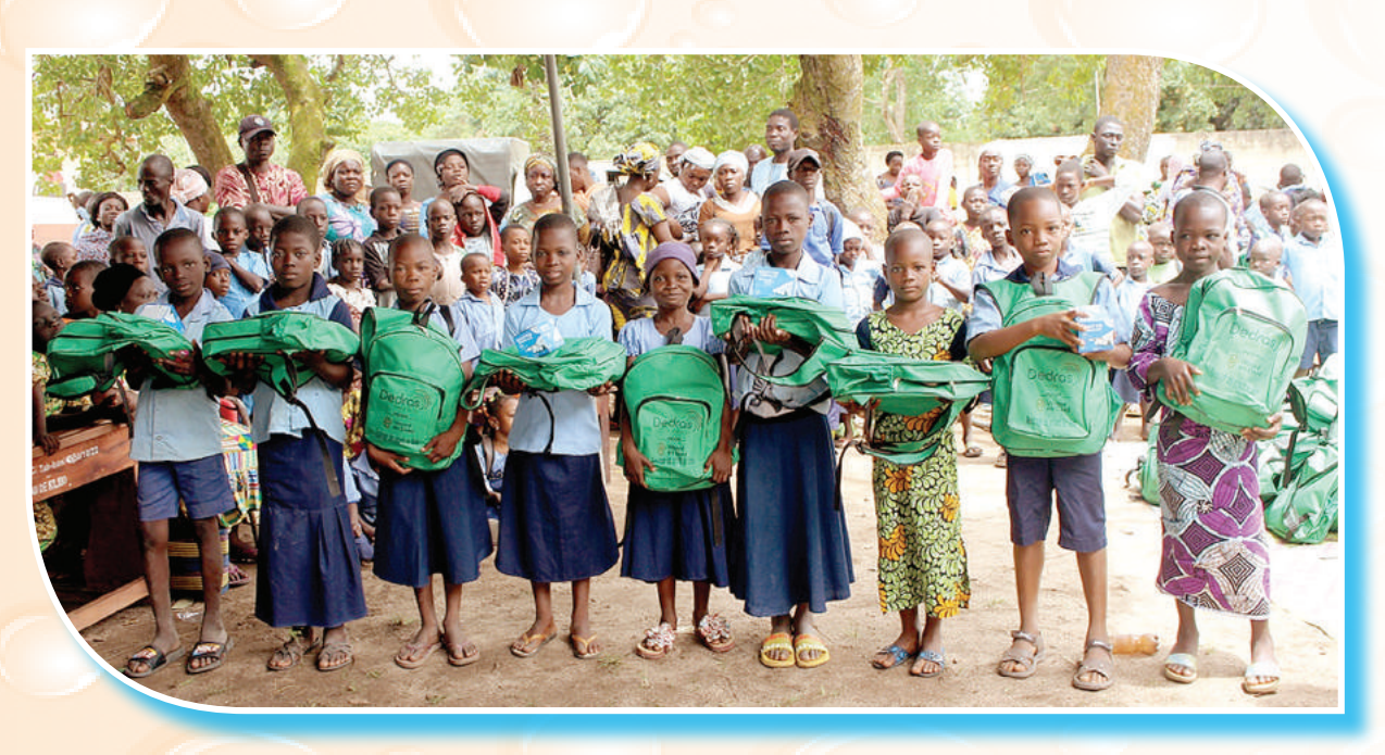
Some children sponsored by DEDRAS of the Evangelical School Complex receiving school kits

DEDRAS, dedicated to the promotion of education in Benin, set up the Education-Sponsorship project with the financial support of Woord en Daad to create an equitable, inclusive, and quality education system.