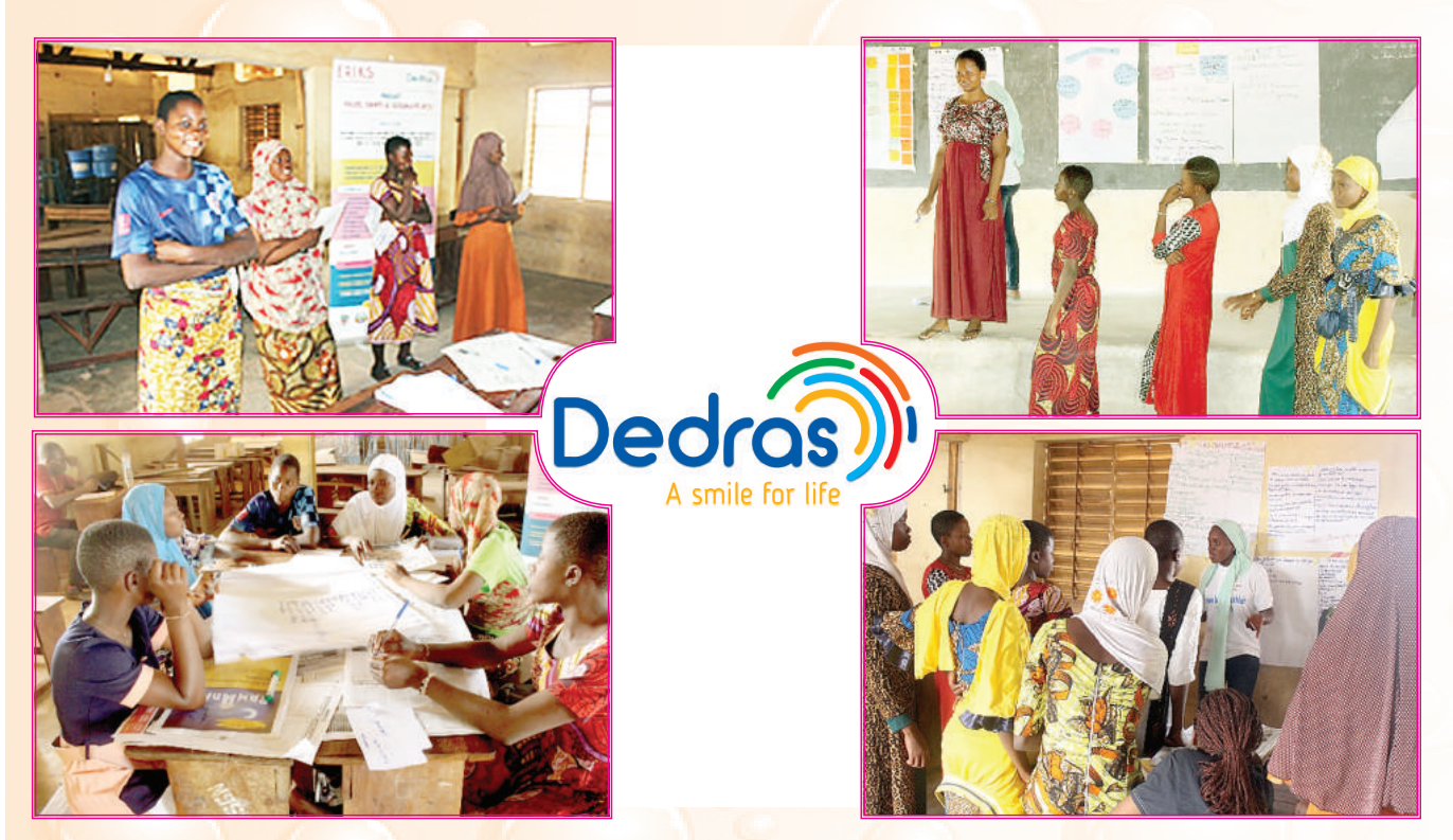
Adolescent girls trained on common life skills CVC

Planned to end in 2024, the F2S project represents a collective movement involving local communities and educational and health institutions. Through this project, DEDRAS draws a new path for the girls and women of Alibori, where health, education, and rights are at the heart of their development.