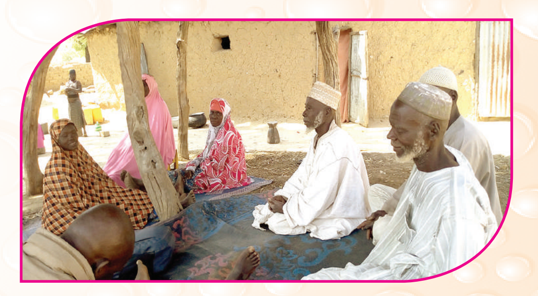
Members of a village monitoring committee in Karimama meet to discuss issues related to children's rights

In Benin, the protection of children remains a top priority, facing persistent challenges such as early marriage, economic exploitation, and other forms of violence, especially among girls. For many years, DEDRAS has firmly committed to the protection of children in Benin through its innovative initiatives and community monitoring committees. These monitoring committees prove to be the essential pillars in the protection and education of children. In partnership with local communities, these committees have become agents of change, detecting and responding to child rights violations with determination and effectiveness.