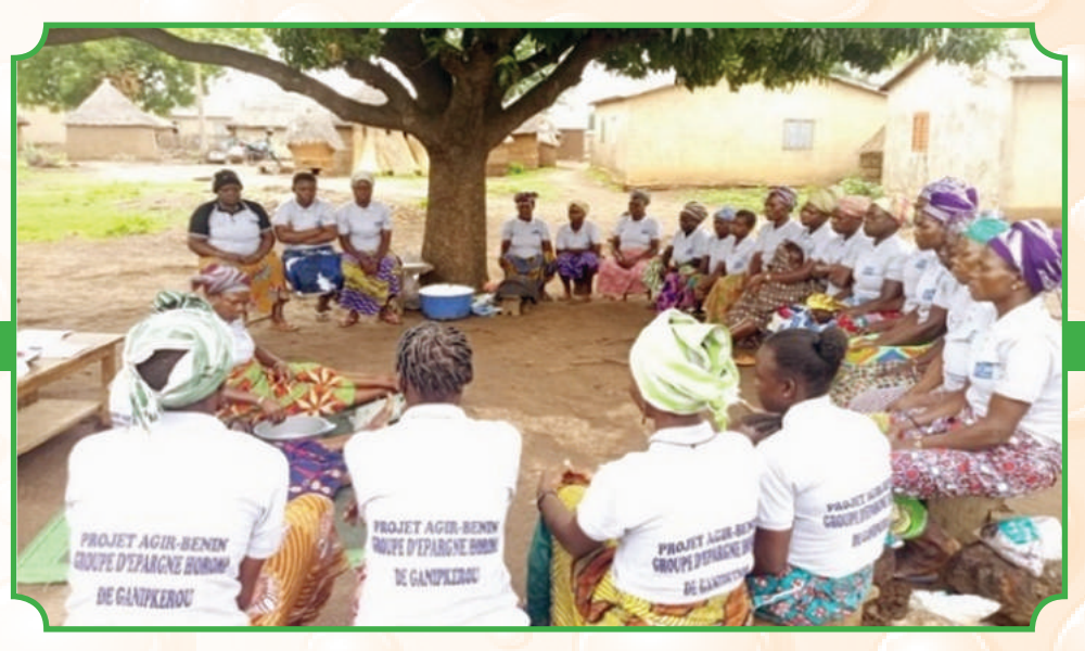
Village Association of Epargne and Credit Horoma of Ganikpérou in a contribution fund sharing meeting

The VSLA put in place by DEDRAS through the AGIR-Benin project plays a crucial role in promoting girls' education and the empowerment of women. By enabling women to actively participate in school decision-making and management through the Education Fund, the VSLA strengthen their empowerment and self-esteem. Their involvement in the fight against GBV creates a safer and more supportive environment for girls' education. Thanks to these initiatives, women become the pillars of change, supporting and defending the right to education for every girl, thereby assuring a more equitable and prosperous future for all. With the benefits of VSLA for grassroots communities, DEDRAS has extended this approach to most of its projects and intends to generalize it for all its development projects and programs in Benin.