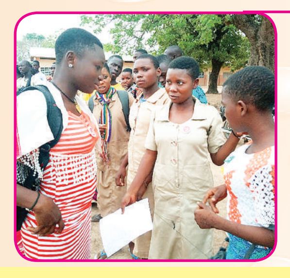
Trained by DEDRAS as a peer educator, a student member of the school club raises awareness to her classmates about child marriage and child rights violations.

Furthermore, the monitoring committees in Benin do not just protect children, they represent hope, a local and effective response to the complex challenges faced by vulnerable children. By supporting these local initiatives, DEDRAS continues its long-term commitment to a future where all children can grow up safely and fully benefit from their fundamental rights.