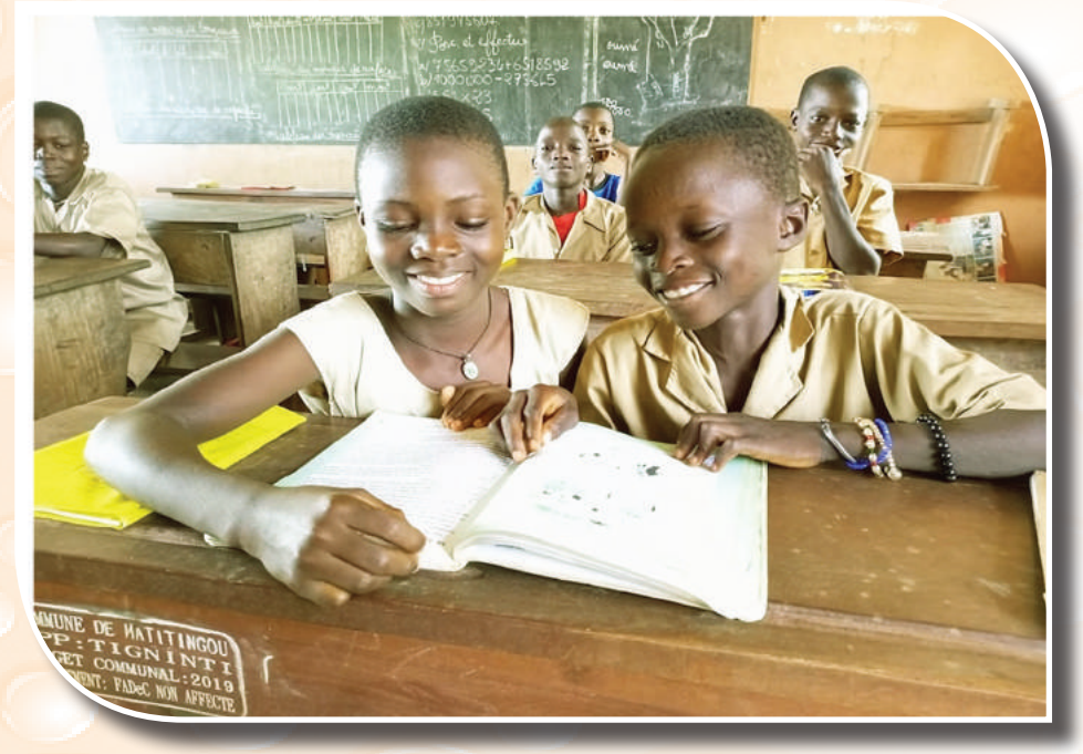
Reading session between members of the EPP Tigninti/Natitingou excellence club

The Governance and Bridging Initiatives Support Project for quality education AGIR-Benin implemented by NGO DEDRAS from 2019 to 2023 and supported by Plan International Benin, Action Education, and the Swiss Cooperation, marks a significant step forward in improving education in the communes of Natitingou, Toucountouna, Tanguiéta, Matéri, Cobly, Boukombé, Kouandé, Péhunco, and Kérou. The AGIR-Benin project transforms access to education for children with disabilities and those in emergencies with a particular emphasis on the schooling and development of girls.